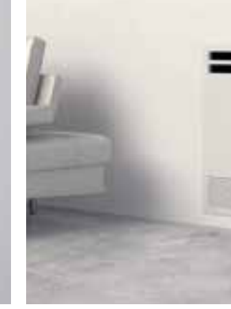
Recessed with aesthetic panel sheet (SLI version and SLIR heating) Wall installation.